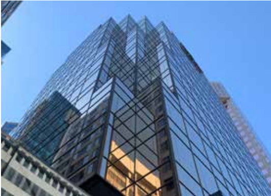
DOWNTOWN – VANCOUVER