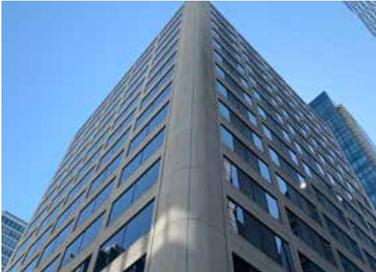
DOWNTOWN – VANCOUVER