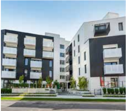
TROUT LAKE – VANCOUVER